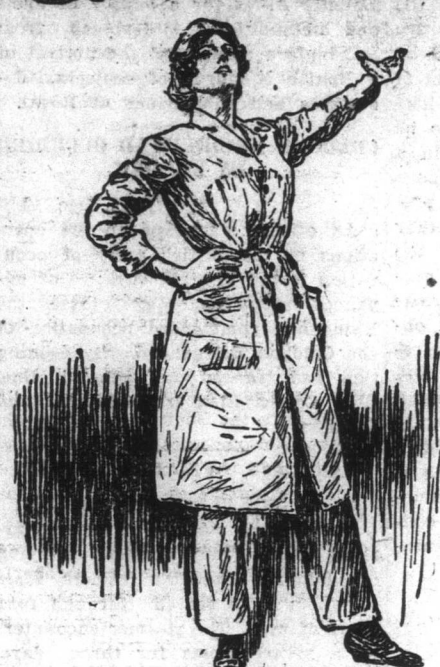
This illustration shows one of the women workers at Port Sunlight in her becoming and workman-like costume.