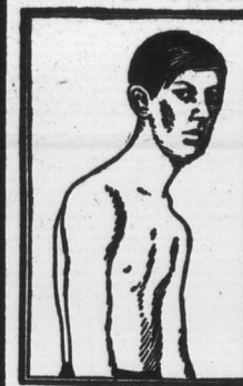
A NERVOUS WRECK