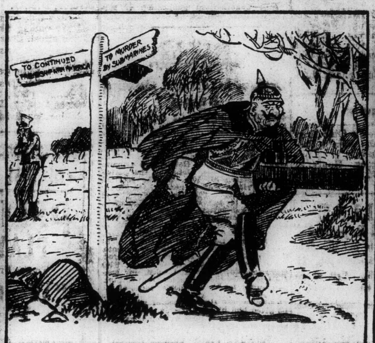
HIS CHOICE. Kaiser Bill: American Friendship: Bah! I prefer to go this road.—News of the World, London.