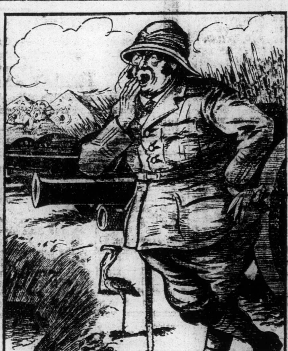
John Bull.—By Jove, it's beastly bad form for the Kaiser to promise one a visit here and then not turn up you know.—Halifax Herald.