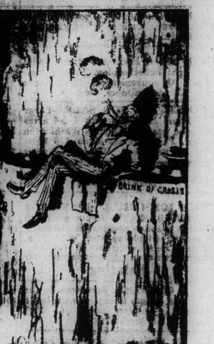
GETTING USED TO IT. Brooklyn Daily Eagle, New York