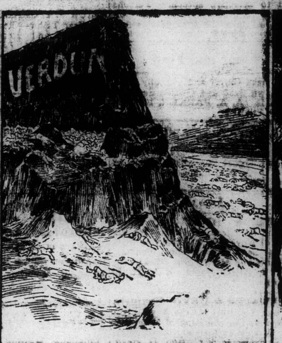
THE HIGH WATER MARK. Philadelphia Record.