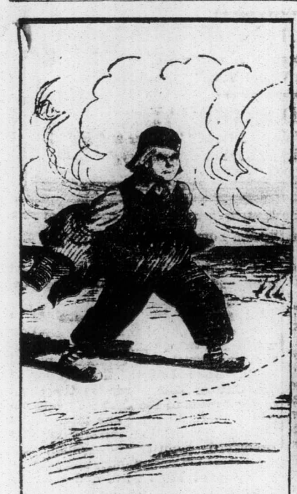
I'M NO UNCLE SAM. Brooklyn Daily Eagle, New York