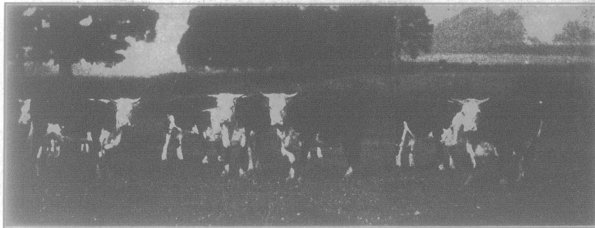
In the Home of the Hereford.

is farrowed the first year but two litters are raised from the mature sows. The brood sows live in six-by-eight and eight-by-ten cabins the year round. During the summer these cabins are placed in rape and clover pasture lots, but for winter they are drawn to the main buildings for convenience in feeding. The sows are fed as economically as possible, but the aim is to have them gaining in flesh during the gestation period and in fair flesh, but not excessively fat, at farrowing time. During the summer pasture is largely resorted to and forms the basis of the ration. Professor Archibald claims that one acre of rape this year saved between $75 and $80 in grain in the maintenance of brood sows. Red clover has also proved valuable in maintaining the sows. Brood sows are fed heavily on mangels and clover hay during the winter. Professor Archibald informs us that the hay is fed in racks, and tons of it are eaten. Grain is fed according to the condition of the sows, and the quantity is increased as farrowing time approaches. This system of feeding develops bone in the young pigs. On the average farm comparatively little clover hay is fed the sows, but we believe that considerable of this