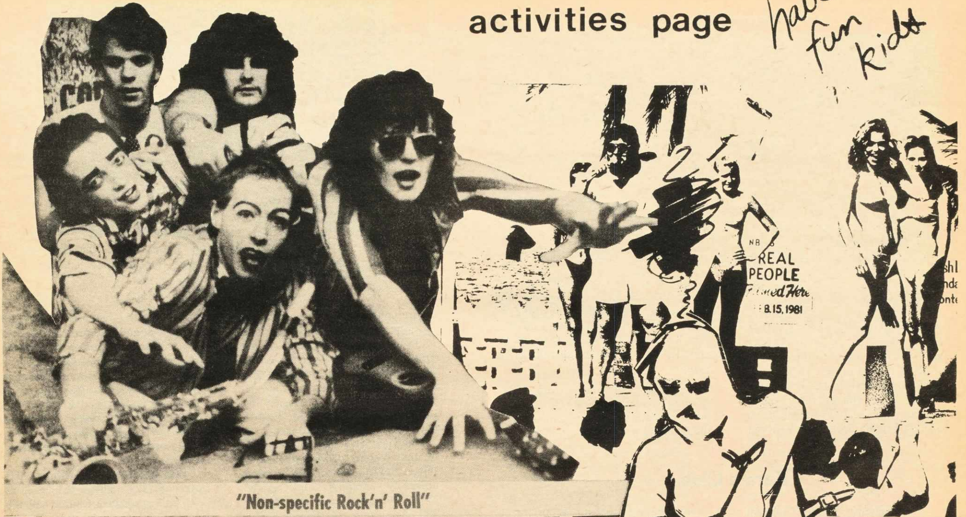
"Non-specific Rock'n' Roll"