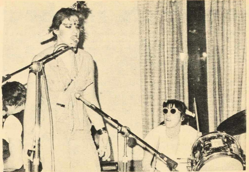
60's hippie or 70's punk?

In 1968, the SUB lobby was more likely to hold some sort of protest group rather than the studious readers of today. Changes are now planned for the lobby itself. Amidst the changes, the SUB still provides a meeting center for 7,500 students. Is it still the 'pulsating heart of campus' which it was a decade ago?