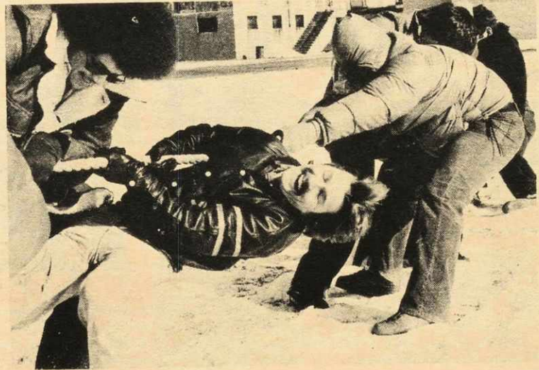
They've always been the same at exam time!