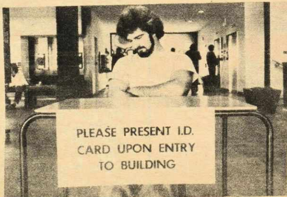
What a classic?