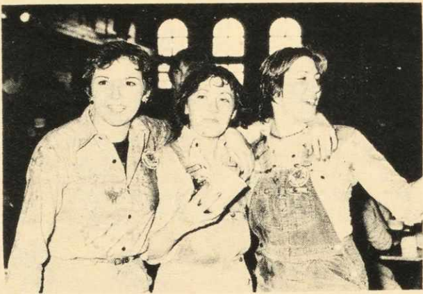
... After a typical SUB night