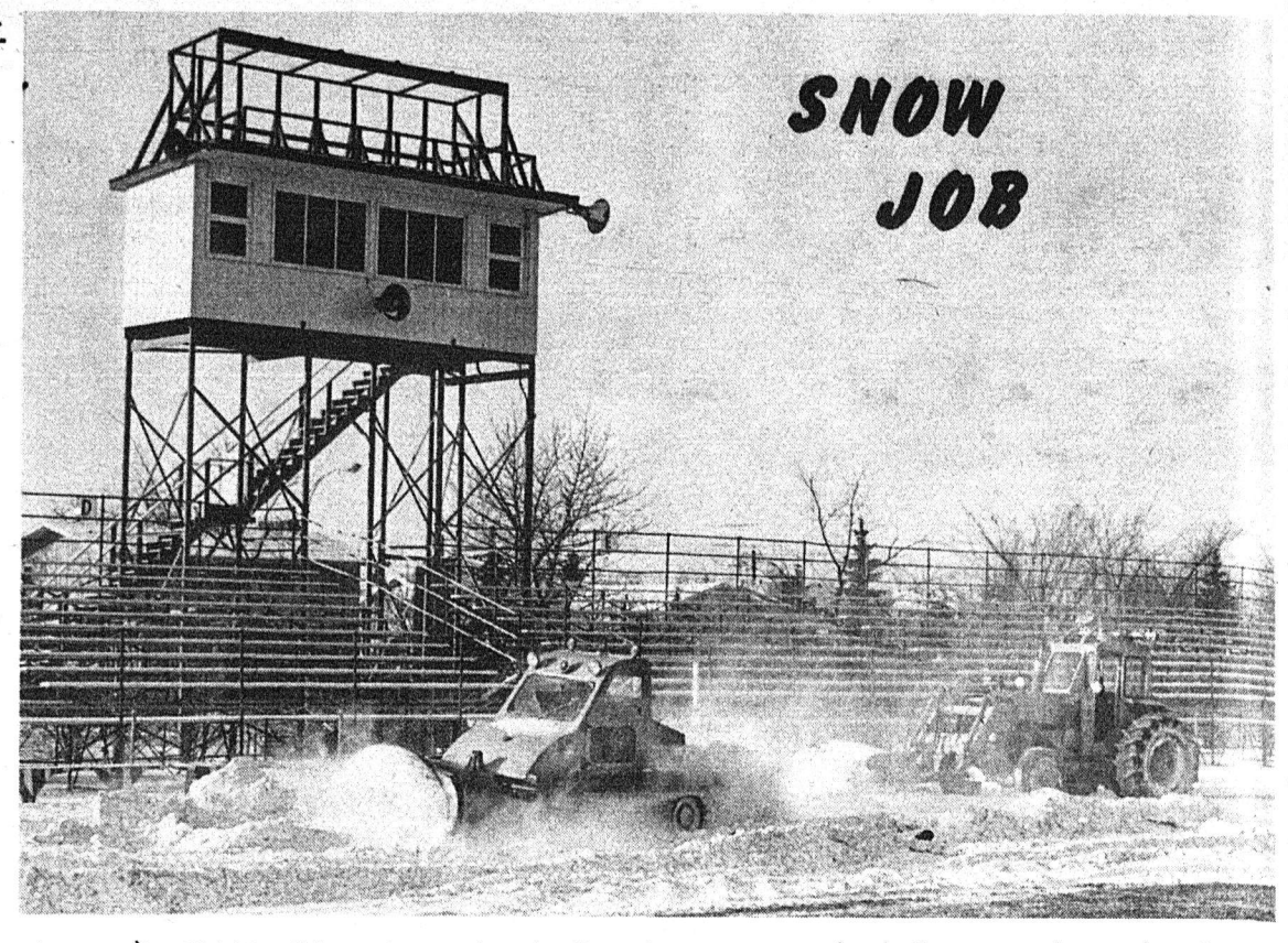
Apparently, Old Man Winter forgot that the Bears have one more football game to play, against the University of Manitoba Bisons, Snowplows are busy clearing Varsity grid for Saturday's 2o'clock

Earth News Sports desk reminds all Steinstossen fans to be on hand in Sugarcreek, Ohio on September 28th. That's the day the Ohio Swiss Festival begins, and that's about the only event in the U.S. where you can get in a little steinstossen competition. For those who don't know, steinstossen involved picking up a 138 pound rock and throwing it. Whoever throws it the farthest wins. It's a very popular sport in Switzerland, but don't look for it on Wide World of