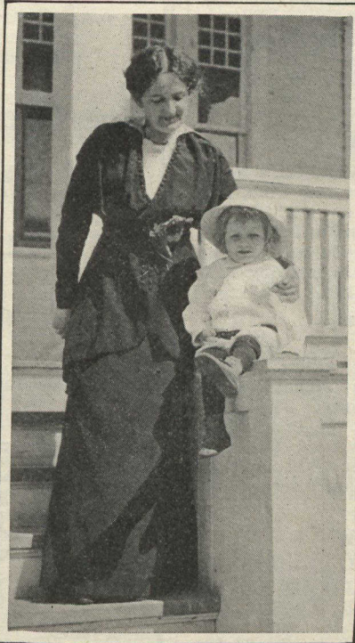
MRS. NELLIE MCCLUNG The well-known writer, who has added "campaigner" to her reputation by reason of her recent adroit manoeuvres to circumvent "Sir Roblin" in Manitoba. She fights him inasmuch as he stands for issues.

"Mr. Pepys in Winnipeg," a tip-top newspaper gossip, has expressed himself quaintly regarding the author, Mrs. Nellie McClung, in the role of campaigner. He says of her address at a local meeting: "Mistress McClung hath every Feminine Charm, and therewith a Voice which is of Womanly Softness, but she doth with it Whatever she doth Choose, and she hath Infinite Variety and Knoweth how to Range from Earnestness to Drollery, and to Flashing Sarcasm, and thereafter to True and High Eloquence, so that I was quite Carried out of myself in Listening to her and Watching her, and Plainly 'twas the Same with every other Hearer."