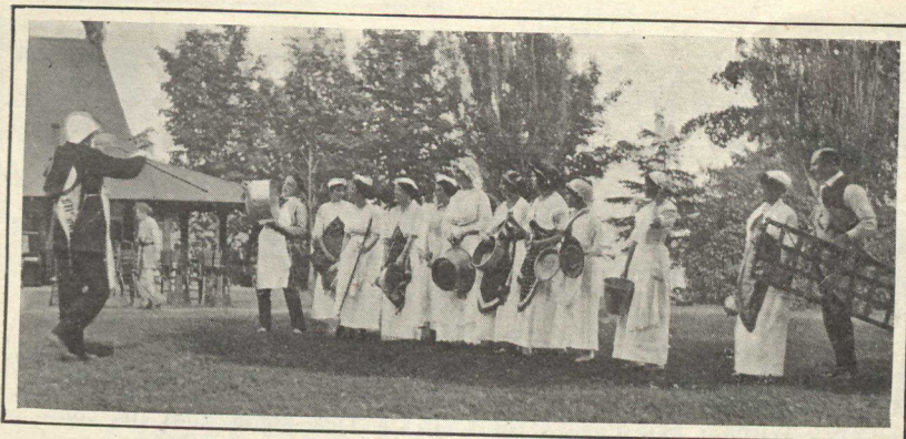
MUSIC WHICH FAILED TO CHARM THE MOSQUITO. When Victoria College, as a kitchen orchestra, contributed its share to the frequent lapses from the "life is earnest" side of the late convention. The "Y" workers all are delightfully human. (See opposite page.)