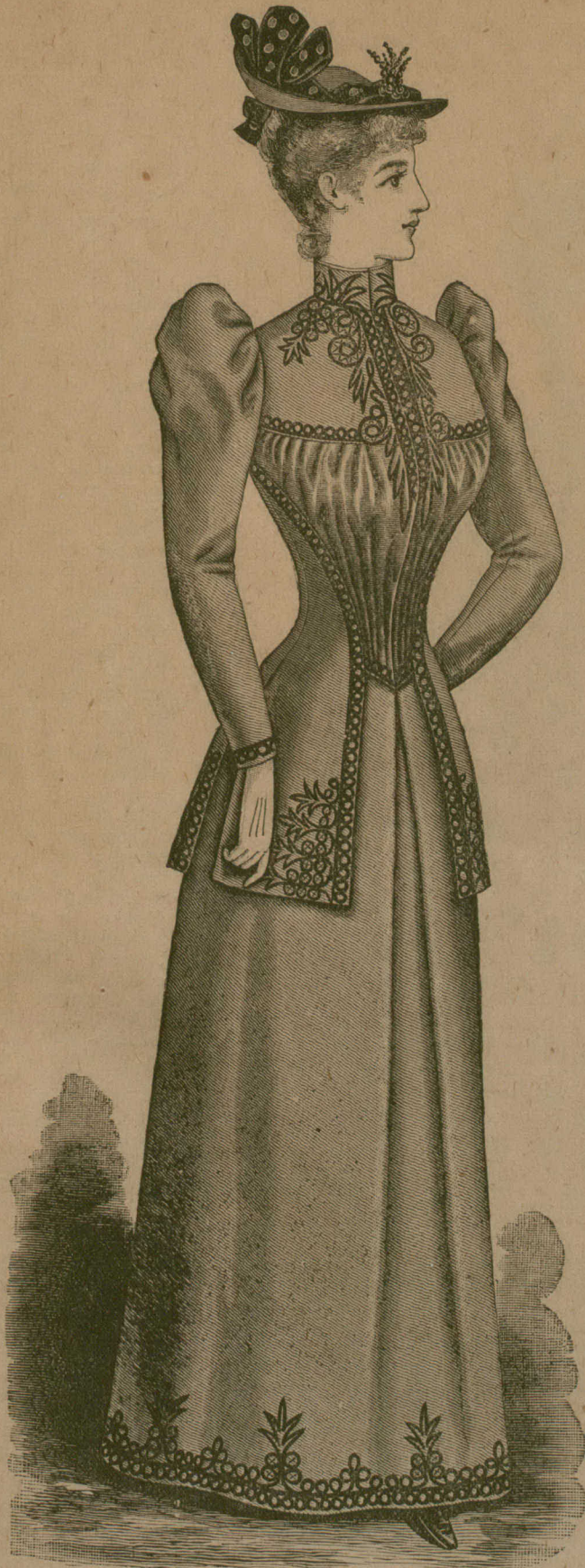
FIGURE NO. 343 R.