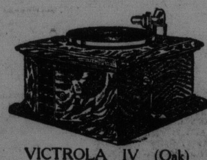
VICTROLA IV (Oak) Price $20.00

Hear your favorite music on the Victrola at any "His Master's Voice" dealer's in any city in Canada. Victor-Victrolas $20 to $300. Sold on Easy Payments (as low as $1 weekly) if desired.