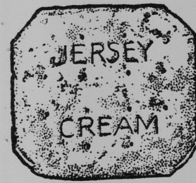
¾ Actual Size