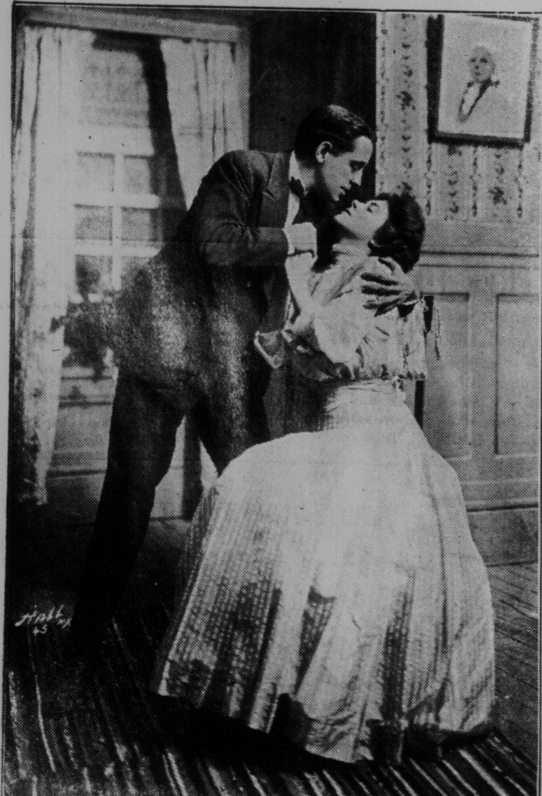
SCENE FROM "THE THIRD DEGREE," THE ATTRACTION AT THE GRAND OPERA HOUSE ALL THIS WEEK.