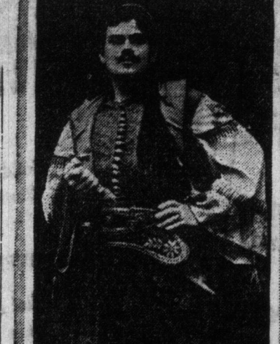
The celebrated tenor, who will be seen with the Boston Grand Opera Company and Pavlowa Ballet Russe at the Arena Oct. 23.

"The Goddess," the serial beautiful and an instalment of the Pathe News