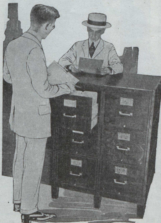
"Office Specialty" Counter-Height Sections

When business is conducted over the top of "Office Specialty" Counter-Height Sections, we drive a deep salient into our old enemy "overhead".