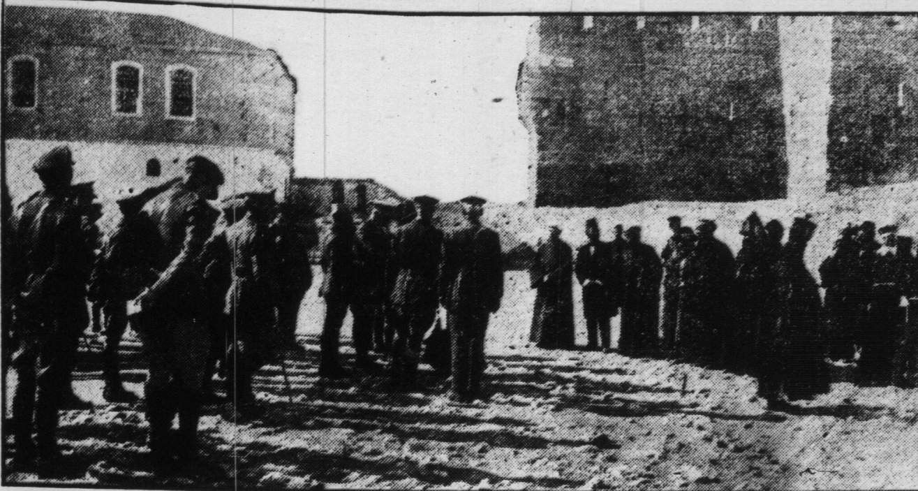
General Allenby receives the city notables in the barrack square.