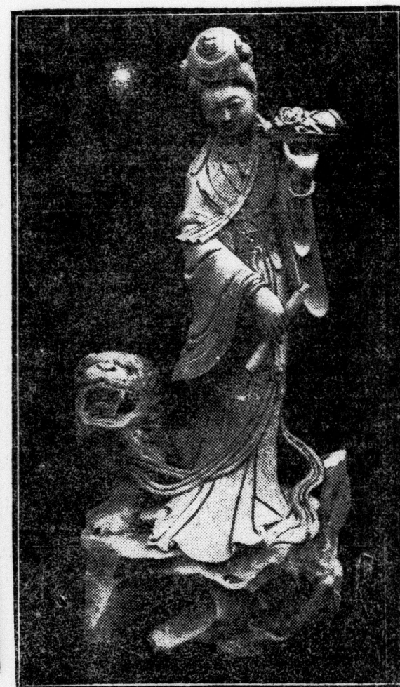
A recent addition to the Royal Ontario Museum. Marble group of lady and dog carved by Chinese coolies during the long winter months.