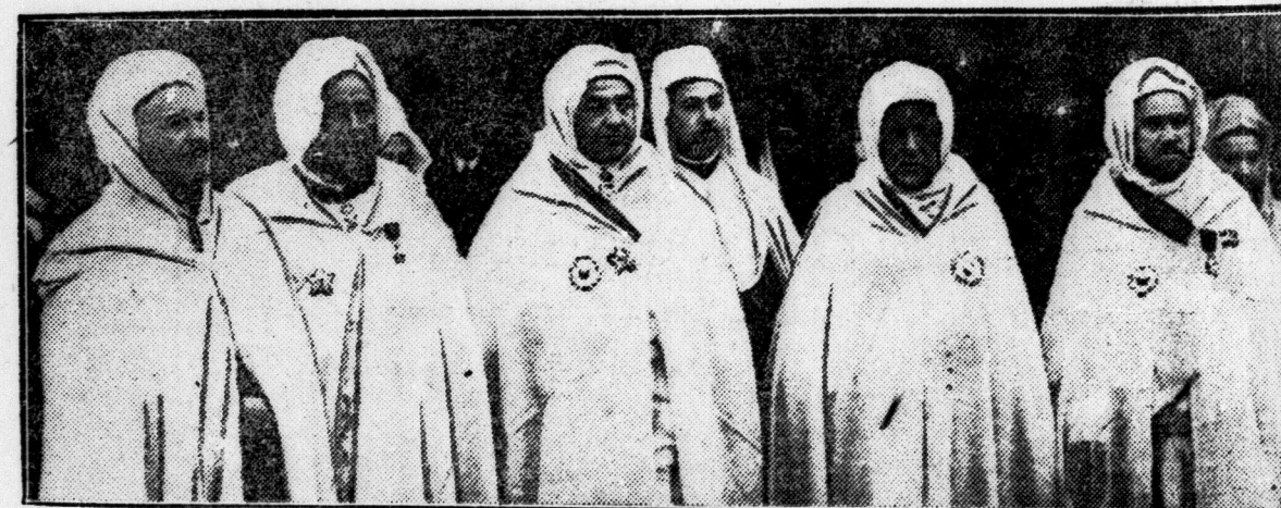
Arabian chiefs who came to Paris for the ceremonies of laying the cornerstone of the first Moslem mosque there.