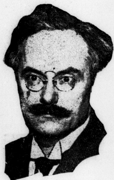
Jean Longuet, French socialist leader, has arrived on this continent for a lecture tour.