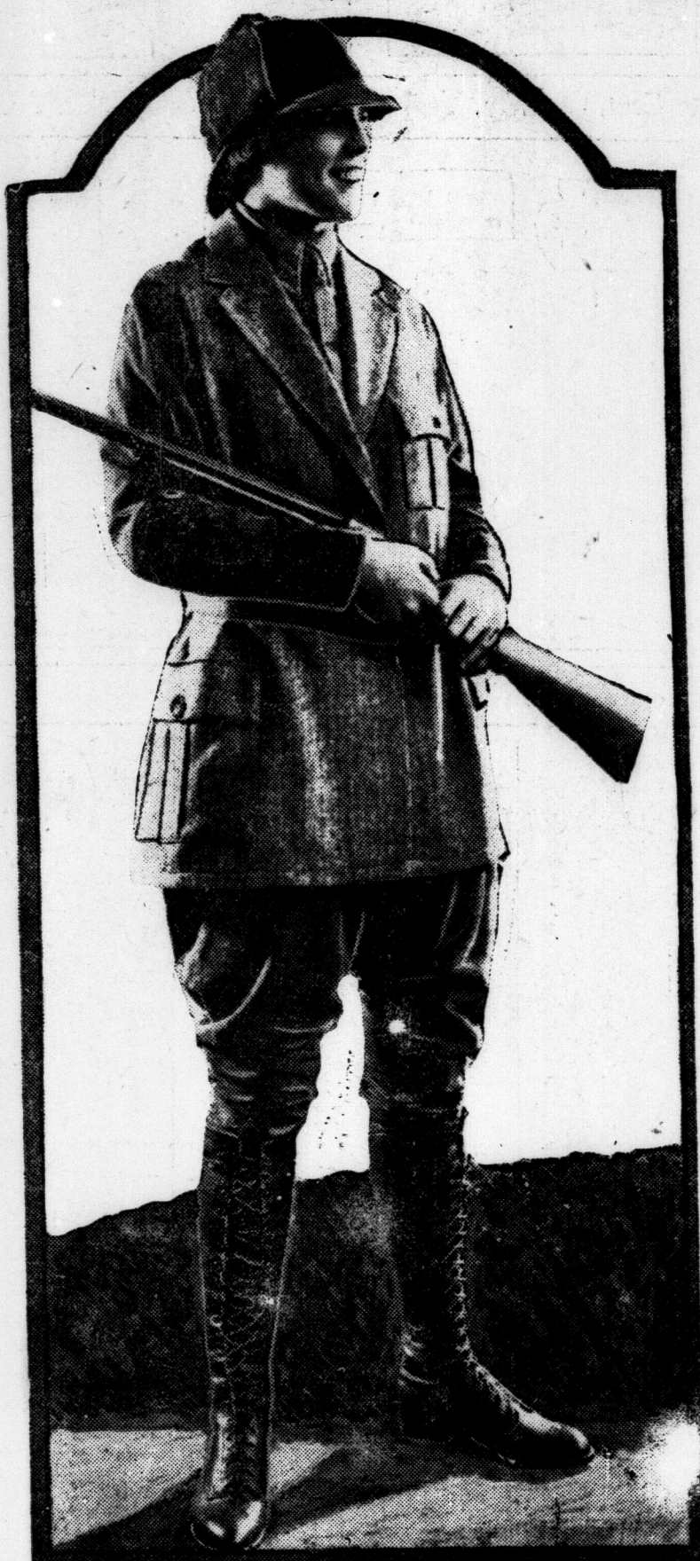
These are the days, not of golf widows, but of hunt widows, unless they don this garb and go too. Coat of tweed with suede sleeves and lining, with knitted cuffs. Breeches of suede.