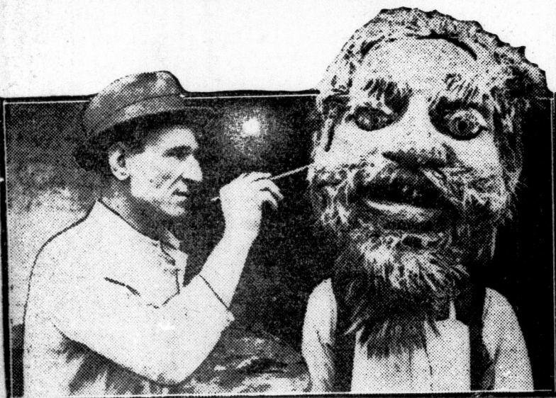
Working on figures for the pantomimes, a traditional feature of the English Christmas season.