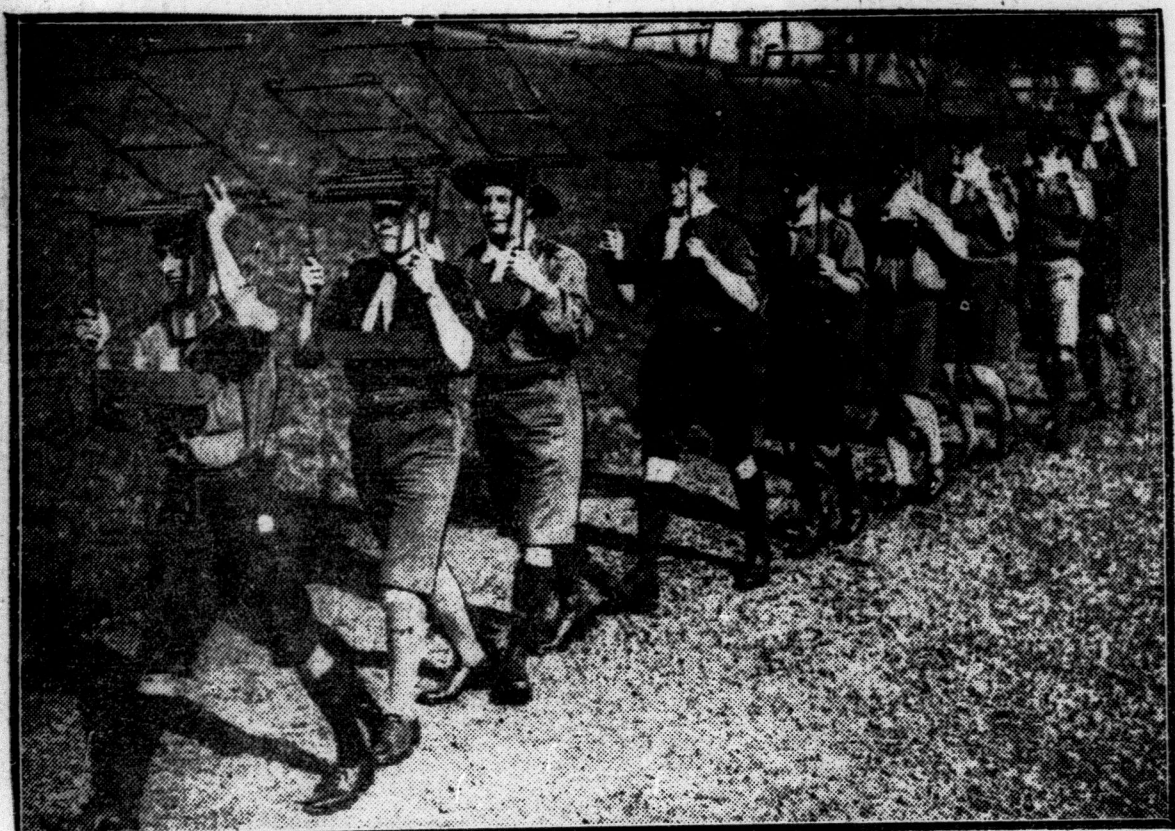
Boy Scouts at the Alexandra Palace demonstration in London, England, getting chairs ready for famous guests, including the Prince of Wales.