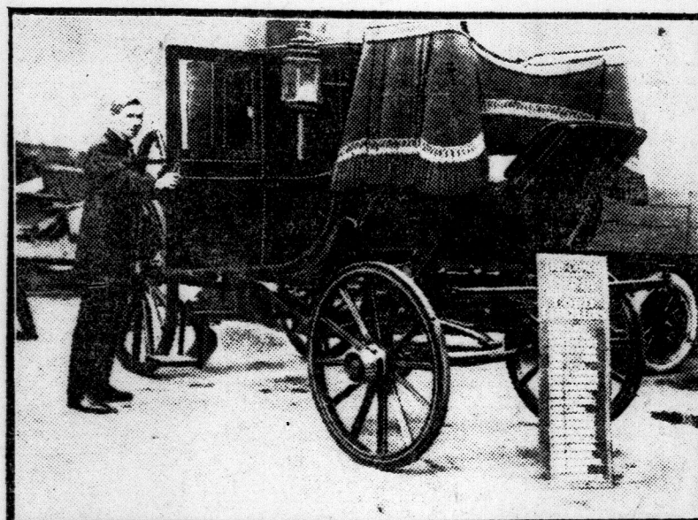
Napoleon's state coach which has also been used by British chancellors from Eldon to Birkenhead has been bought from the House of Lords by an East Ham motor agent who is now offering it for sale at $150.