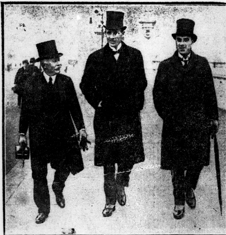
Three new British ministers leaving Buckingham Palace after being sworn in. Left to right, the home secretary, Hon. Wm. Bridgman; Hon. E. F. L. Wood, president of the board of education, and Sir Philip Lloyd Graeme, president of the board of trade.