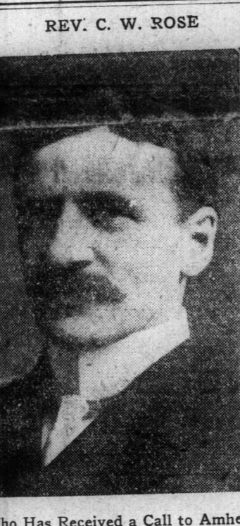
Who Has Received a Call to Amherst, N.S.

ACK DIAMONDS 137 West Street ou ever hear of the new iamonds. West Street The National pany are putting in forty of the brightest and best Scranton Coal that money We have arranged that all al is picked by an expert n the benefit of his experi- Coal is largely used by facturers. Because the med- y must obtain its light, heat res are lowest now just to and getting your coal in you inconvenience and ex- ter. to: FAIR AND SQUARE NAL COAL COMPANY WEST STREET, CITY Both Phones 219 will be appreciated.