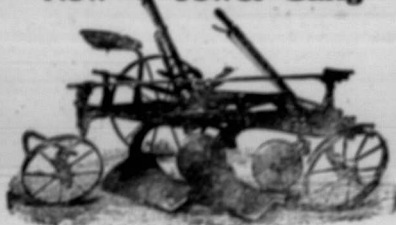
New Jewel Gang

BUILT entirely of steel and malleable iron—has great strength and durability. The frame, beams, bails, axles and braces are of high carbon steel—the frame will stand the severest tests which a plow of this kind will ever have to undergo. Steel wheels have long removable dust-proof bearings with large wearing surfaces insuring long life and small cost for repairs. With hard oil these bearings require very little attention. Land wheel is large and fitted with cushion spring to absorb shocks. This plow is equipped with a high lift attachment, which is worked by the foot, leaving both the driver's hands free to manage the horses. A special device locks the plows up when raised from the ground and locks them down when set for work. This locking device can be arranged to enable the bottoms to raise up when striking an obstruction, a great advantage in stony land. The plow gang is made with 12 in. or 14 in. bottoms, cutting breaker or stubble (interchangeable.)