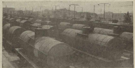
"Imperial Asphalts can be quickly delivered to any part of the Dominion. They come in tank cars or packages, whichever is best suited to your requirements."

"There are three Imperial Asphalts for road purposes, Imperial Paving Asphalt for preparing Hot-Mix Asphalt (Sheet Asphalt or Asphaltic Concrete), Imperial Asphalt Binders for Penetration Asphalt Macadam and Imperial Liquid Asphalts for dust prevention and for increasing the traffic-carrying capacity of earth, gravel and macadam roads."