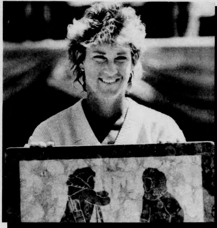
CANADIAN, EH? Carling Bassett (left) is Canada's only top calibre competitor and it may be a while until our country produces players in the league of Chris Evert-Lloyd (right), this year's Player's Challenge champion.