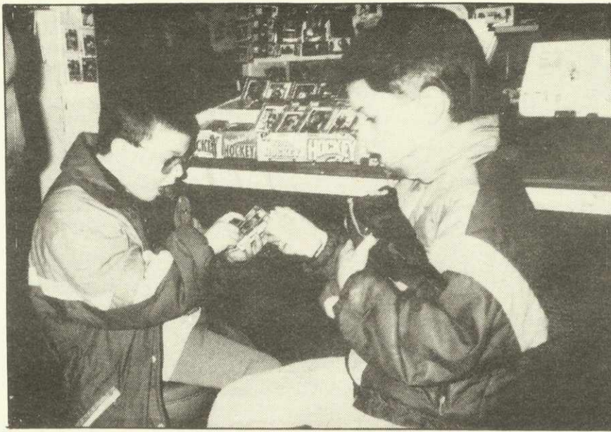
Baseball Card Phenomenon by Amol Verma

Baseball cards are very popular because of the good prices and good players. People also like collection for money so they choose baseball cards because they are worth a lot. I recommend baseball cards if you are going to collect cards. Baseball cards are very popular at D.U.S. because people just started collecting.