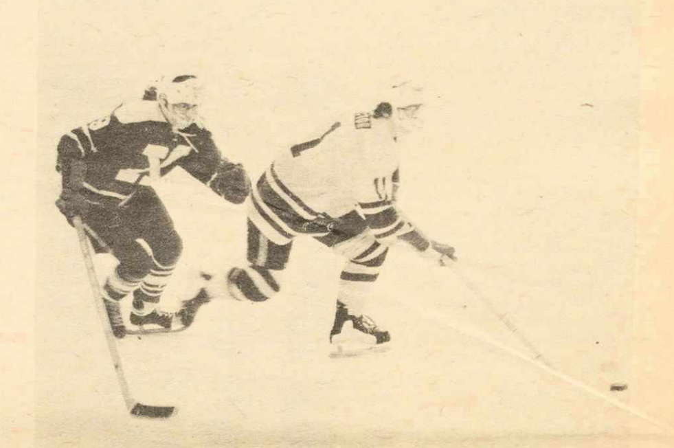
Women's hockey tournament held here. Halifax West took the championship.