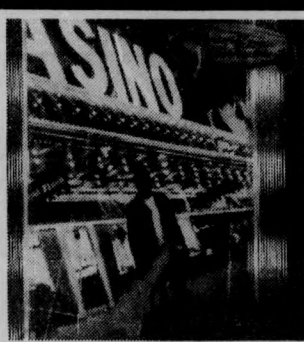
Brian Setzer Orchestra Guitar Slinger Interscope/MCA

The second release by this former leader of The Stray Cats is a hard-hitting medley of music. Guitar Slinger presents a variety of songs that takes you back to the early '60s, with a mix of rock, big band, swing, jazz and blues. Much like Colin James and The Little Big Band, Brian Setzer's music is reminiscent of old-style rock and roll and the Big Band era of music. The lyrics are simple, yet expressive, and the music ranges from slow-beat swing to high energy rock. Personal favourites include "The House is Rockin'", "(Everytime I Hear) That Mellow Saxophone" and "Sammy Davis City". If you're a fan of big band music and swing, this is a good album to pick up.