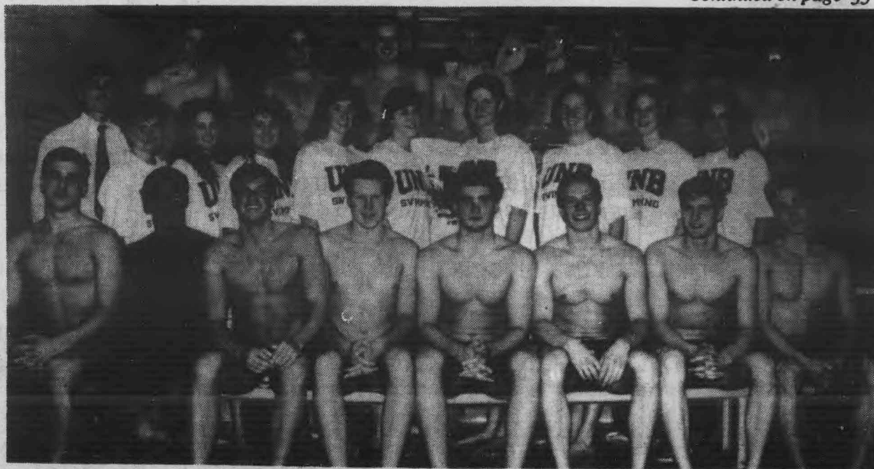
UNB Beavers had a successful year in the pool by finishing 7th in the country