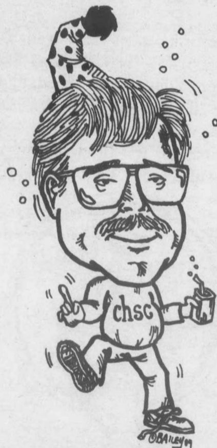
That's Sir Slime to you!!

Word of the week ... LAODICEAN: Someone who is lukewarm or indifferent in religion or politics.