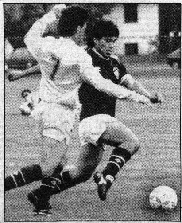
This Huskies' player tries to ward off a forward.

The roughness of the game was not a surprise to the Pandas. "They've always been a rough team,