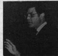
Nicaraguan ambassador Lacayo

Proceeds from the event will be used to send six Crossroads volunteers to development projects in the Third World.