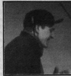
Prairie Boy's Winter: a charming look at Canadians and the innocence of childhood P10