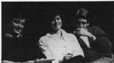
Candidates enjoy last year's forum

Robin Williams talks about his new film Good Morning Vietnam drugs, movies, life and dreams ..... P17