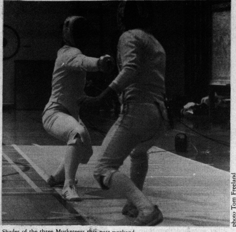
Shades of the three Musketeers this past weekend.

The men's 10000m race starts at 2:00 p.m. and the ladies 5000 goes at 2:45. This is a very large cross-country meet with seven Univer-