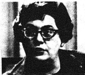
with Judy Lamarsh