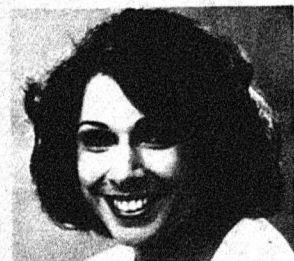
Barbara Frum "voted best public affairs broadcaster"

The kind of program that makes your morning complete — refreshing, provocative informative and just plain fun. weekdays 9:13 to 12 noon