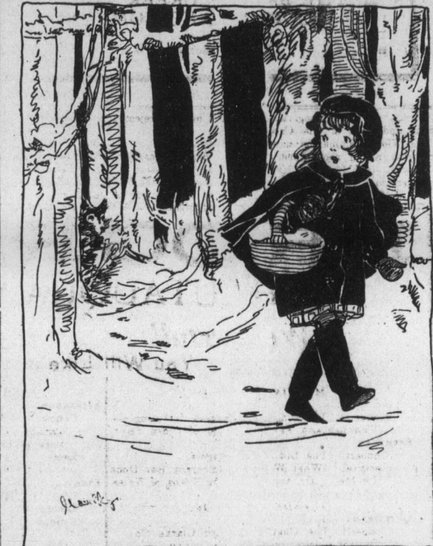
She Looked Over Her Shoulder And There Peering Through The Trees Was A Large, Shaggy Animal.

"as if I was a big, enormous giant coming," thought she. So, to make it more sociable, she began talking to herself. "Snow White and Rose Red—That's a nice fairy story. Wish I had a sister. Let's see! They lived in a little house in the woods. One night a bear came—ahem!" The mention of "bear," gave Elizabeth an uncomfortable feeling. She looked over her shoulder and said hastily: "It wasn't a real bear. It was a prince. He had