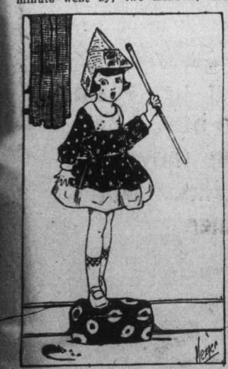
Three Minutes! Four Minutes.

"Not here," laughed the teacher as Eleanor took her seat, "but I think I'll still have to call you Miss Talk-ey because you talk so well about a land we have never seen."