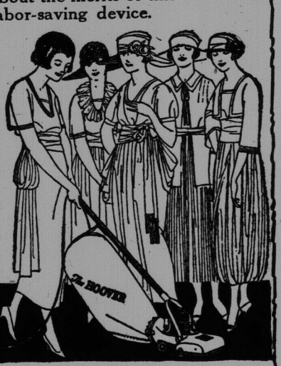
(Carpet Dept., Germain Street

slightest injury to carpets. Our salesman will be glad to call at your home and make a practical demonstration, showing you just why we are so emphatic about the merits of this wonderful