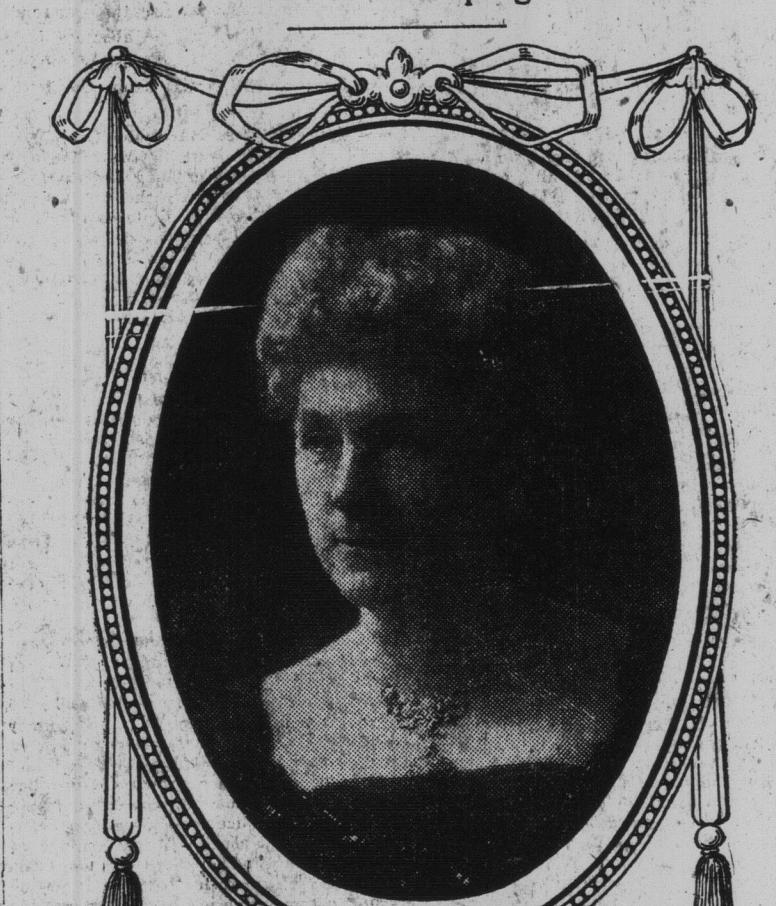
LADY HEARST, WIFE OF THE PREMIER OF ONTARIO.

Lady Hearst Calls Upon Ministers to Help In Food Campaign