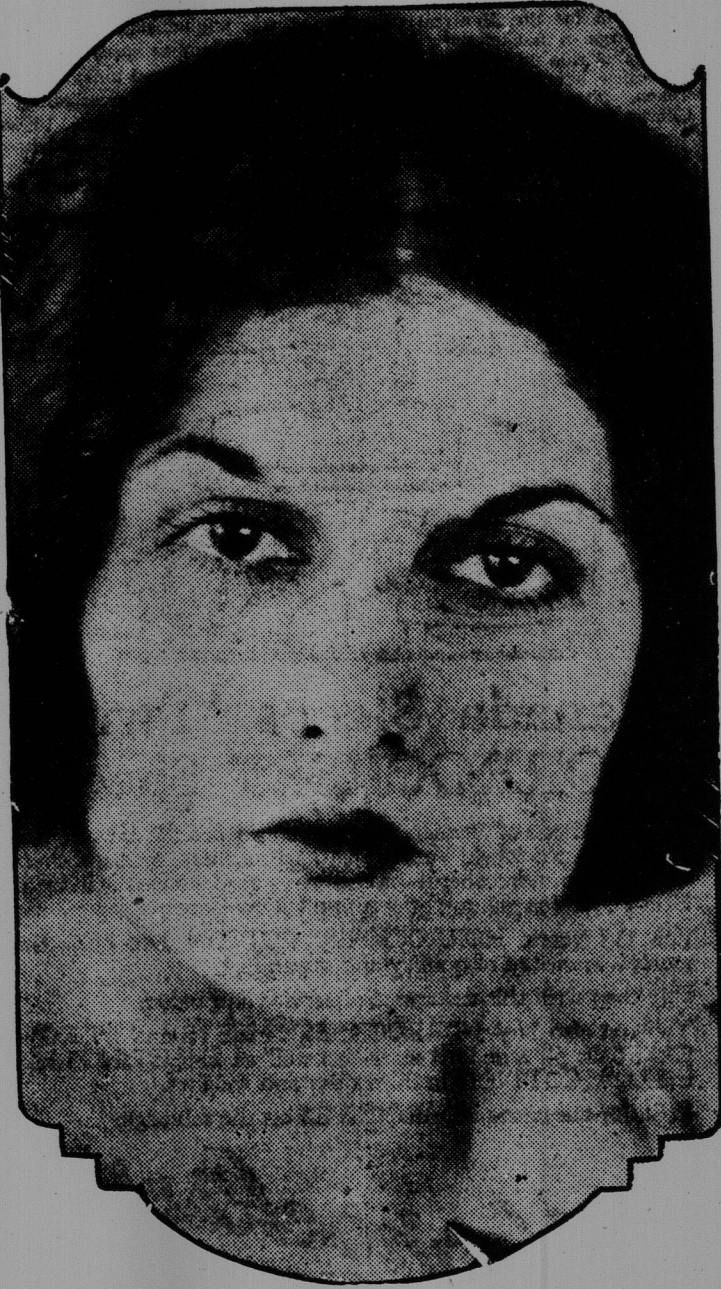
Evelyn Brent, former leading lady for Douglas Fairbanks, has joined Doug and his wife, Mary Pickford, in the libel suit against an eastern magazine. The publication, their petition contends, asserted Miss Brent had caused a rift in the Fairbanks' marital life. This, all three deny. And what's more, they allege the magazine said Miss Brent was fired by "Doug" because she was "growing fat."