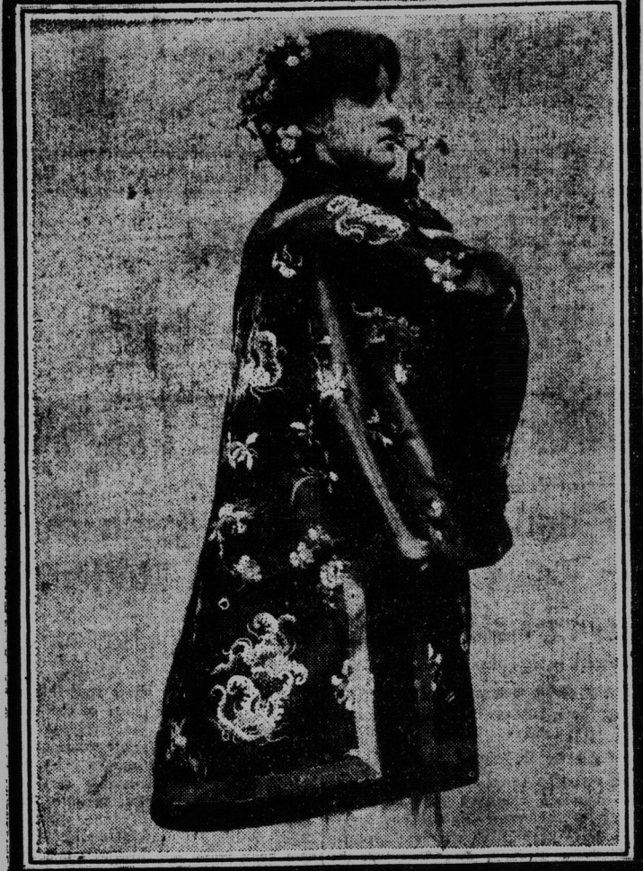
THE KIMONO EVENING WRAP.

It needs no second glance at the mode of the spring to follow the Japanese tendency in the predictions of one and all designers and makers. The sleeve, as we all know, is the feature of the kimono, and so it is that the sleeve is that part of our costumes, separate waists, coats and jackets, which give the garments their style value in the current fashions. The most extreme form of the Japanese idea is a kimono evening wrap showing little variation from the national dress of the Japanese woman. Its length is curtailed to several inches above the knees, and the slashing at the side over the garment over the full skirt beneath. These wraps are made of exquisite soft, dark satins, heavily embroidered in true Japanese designs, have the wide, square sleeves, are collarless, and fasten in double-breasted fashion, with tiny metal or crocheted buttons and cord loops. In fact, many of them are importations from the Orient itself, and bear prices which restrict their possession only to a favored few.