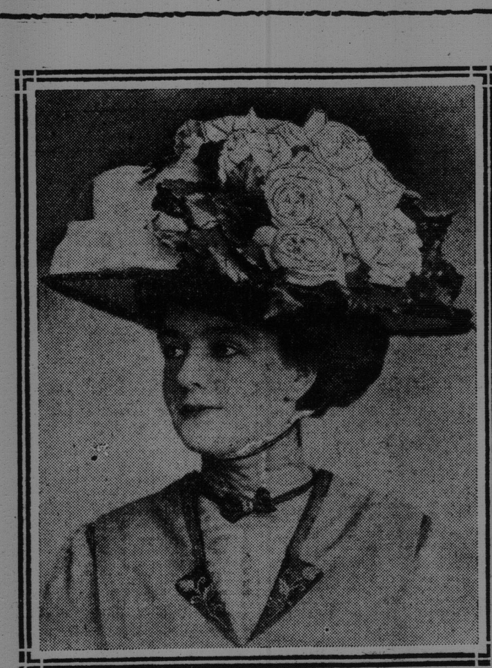
CABOCHON ARRANGEMENT OF ROSES. The pale buff of tea roses is here combined, with the soft dull olives of bronze foliage. The hat is black straw of rather coarse weave, with a facing of satin in the tea rose shade. A cloud of pale yellow tulle encircles the crown and makes an artistic background for the mass of yellow roses and their olive green leaves. This hat was designed to accompany a coat and frock suit. The upper part of the frock is shown, the bodice being built over a guimpe and sleeves of tucked net in the shade of the cloth.