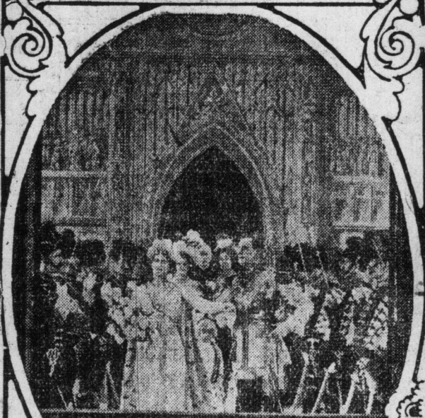
THE FALSE KING ON THE WAY TO HIS CORONATION