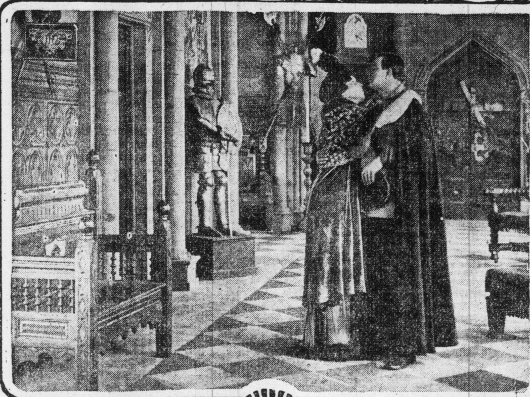
"IF LOVE WERE THE ONLY THING"

"The Prisoner of Zenda is better in motion pictures than the original production."—New York Press.