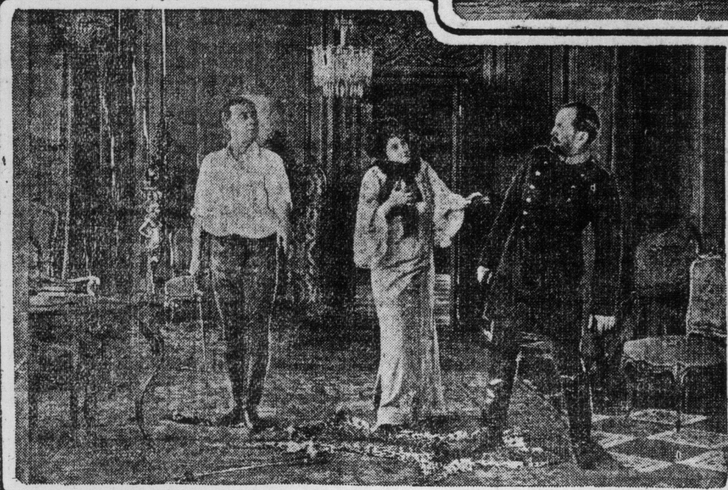
THE KING IGNORES HIS MINISTERS

Fate—Fate and a woman's heart, a woman's heart and its hunger—these combine the thrilling theme of "The Prisoner of Zenda"—the tale of a man who was a king, and a king who was a man!