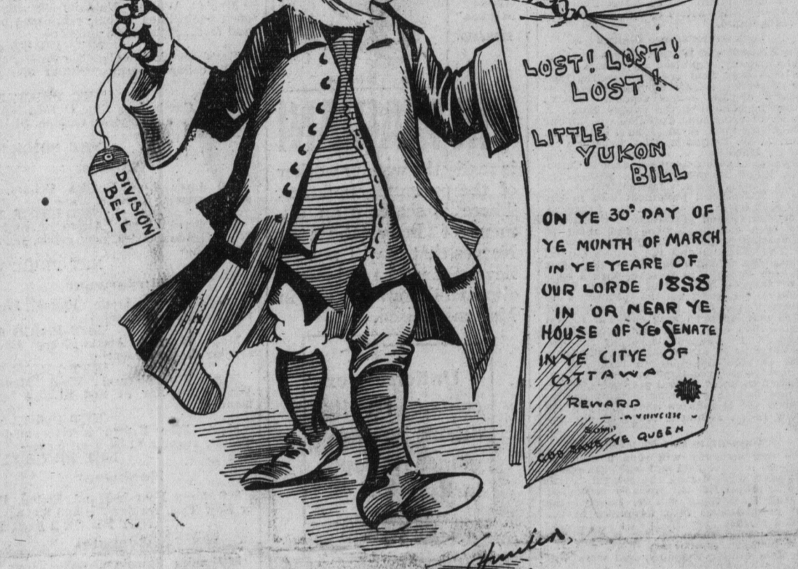
A time-honored institution which that hysterical old lady The Globe would like to see abolished.

FIGHTING THE DERVISHES PACIFIC COAST NEWS. FIGHTING THE DERVISHES PACIFIC COAST NEWS.