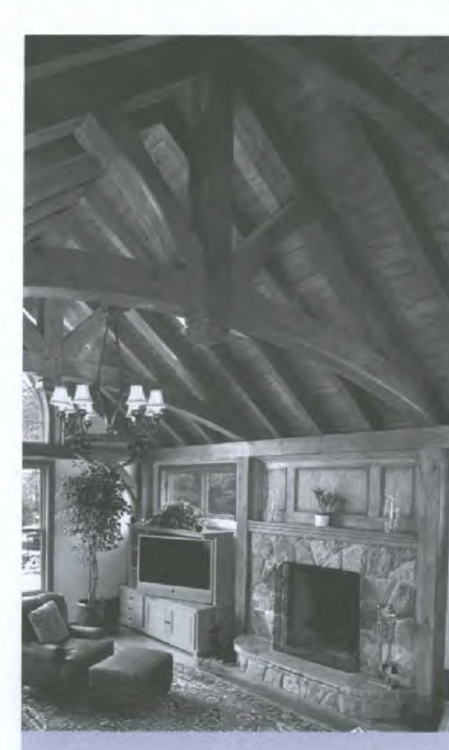
A Normerica timber frame home