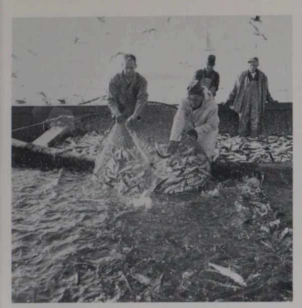
Commercial fishing boats come in many sizes.