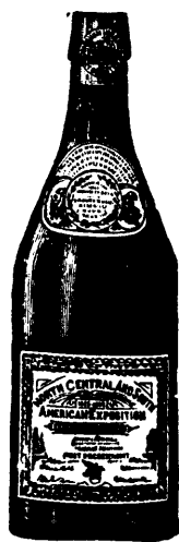
FAC-SIMILE OF WHITE LABEL ALE