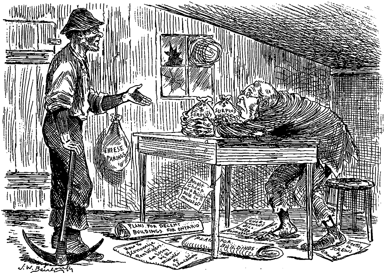
THE ONTARIO "ECONOMIST."

Labor.—I DROPPED IN TO SEE WHEN YOU INTEND GOING ON WITH THAT NEW HOUSE.