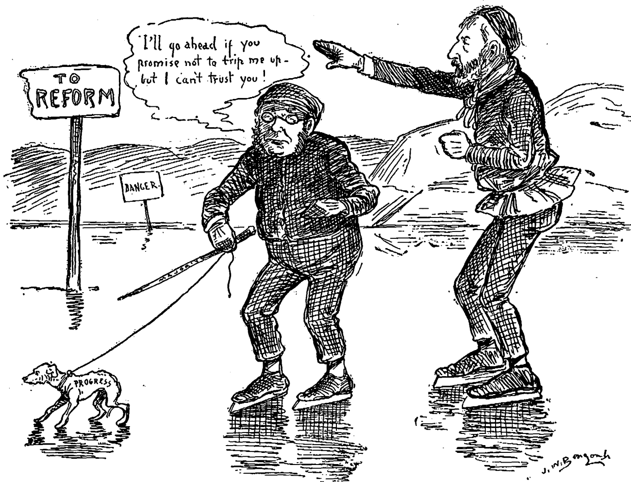
AFRAID TO GO AHEAD!