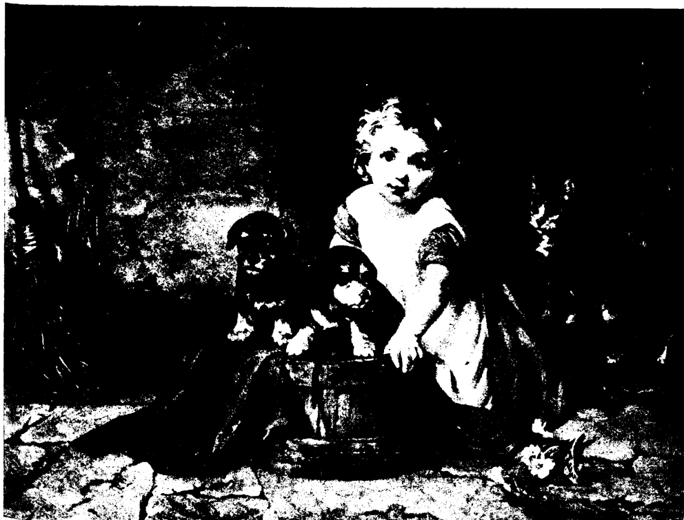
THE HAPPY FAMILY.