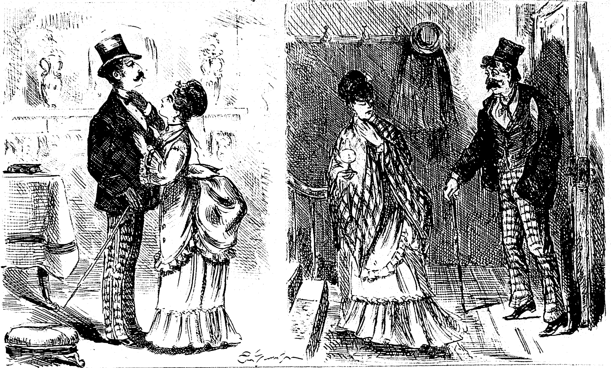
Delicate Wife. —"Are you going out, Charlie? Won't you take your Popsywopsy with you? Dr. Walker says I ought to take more exercise at this exhilarating season. He says there's champagne in the air, now!" Affectionate Husband. —"Another time, my darling. To-day I have to meet some influential business friends."