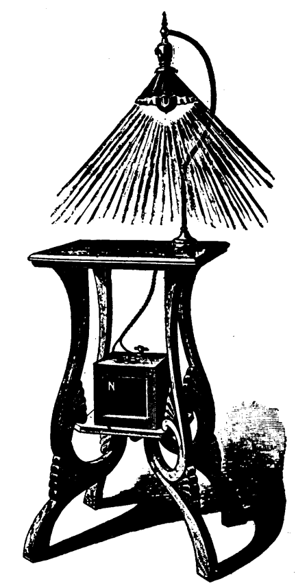
CROWDUS BATTERY WITH LAMP.

By recent important and novel improvements made by Mr. Walter A. Crowdus the output of the primary battery has been so increased that quite a powerful and constant battery is made to occupy a very small space. An idea of this power is best obtained by a comparison with the well known bluestone gravity cell. The Crowdus type of battery, 6 inches square, will, it is stated, develop a current equal to that of 200 bluestone cells, each 6 x 8 inches. Of course the total life of the