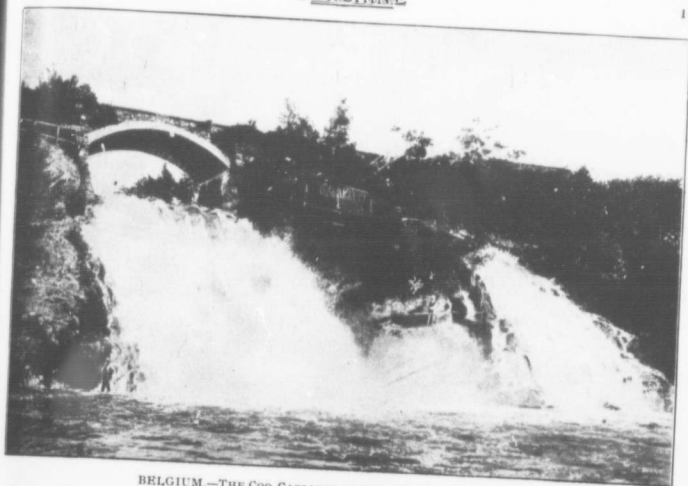
BELGIUM.—THE COO CASCADES AT SPA. (Les Cascades des Coo.) The famous watering place.