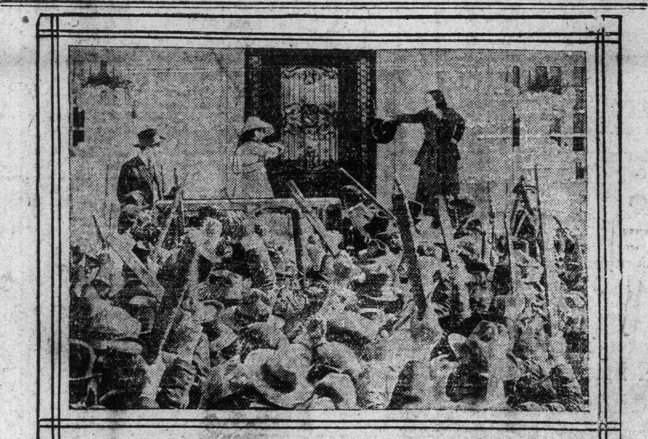
SCENE FROM THE BIG UNIVERSAL JEWEL PRODUCTION "THE RIGHT TO HAPPINESS" STARRING DOROTHY PHILLIPS AT THE GRAND OPERA HOUSE FOR THE REMAINDER OF THIS WEEK.