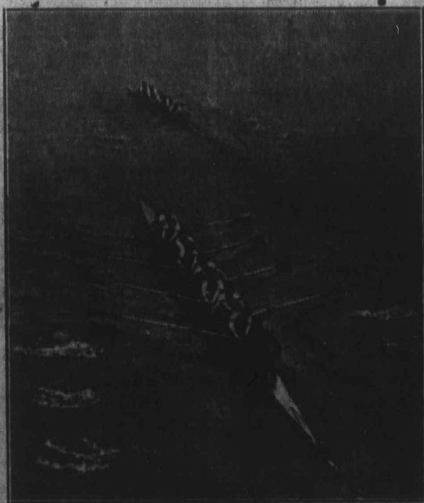
The two crews, Oxford and Cambridges, photographed after passing under Hammett's Bridge with Cambridges well in front. The race finished with a win for Cambridge by four and a half lengths.