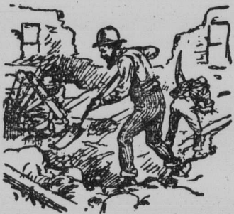
"I WAS HELPING TO DIG OUT THE CELLAR."