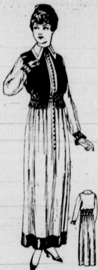
8535 Shirred Gown, Small 34 or 36, Medium 38 or 40, Large 42 or 44 bust.

Here is a very attractive, graceful gown, simple withal, that can be worn appropriately by any woman, yet which by means of its adjustable shirrings is adapted to maternity use. It is made with a two-piece skirt and simple blouse, for it is the two materials that give the effect of a separate over-blouse. In reality the sleeves and the vest are stitched to the main portion. Here charmeuse satin and crepe are used together, with the sleeves of chiffon, and the combination is an attractive one, but the gown can be utilized for anything that can be shirred successfully. There are beautiful soft wool crepes, challis is always good, albatross makes a pretty gown, and among the silk materials are crepe de chine, charmeuse satin and the India and foulard silks that will be in demand for many months. The blouse and skirt are joined and closed at the front.