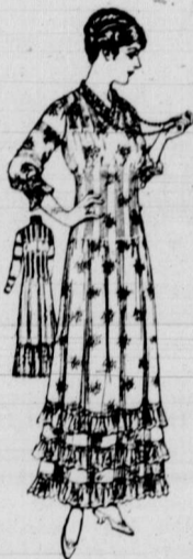
8548 Princess Gown, 34 to 42 bust.

Here is a new model that is made in princess style tucked to form its own girdle. The skirt flares becomingly and gracefully, and the ruffles accentuate the effect of width. Altogether it includes the newest features. It can be made with either V-shaped or high neck, with three-quarter or long sleeves, and as a result the model can be utilized for the dressy frock and for the plain one. Fine tucks always suggest lingerie fabrics and the lawns, batiste, voiles, fine cotton crepes and the like make up charmingly after this model, and this season we are utilizing cotton in every known way, yet this gown also would be pretty for the very thin silks that are treated in lingerie style. In the illustration, flowered crepe is trimmed with lace insertion and the effect would be equally good whether the crepe were silk or cotton. The gown is a very simple one to make, very dainty and charming in effect.